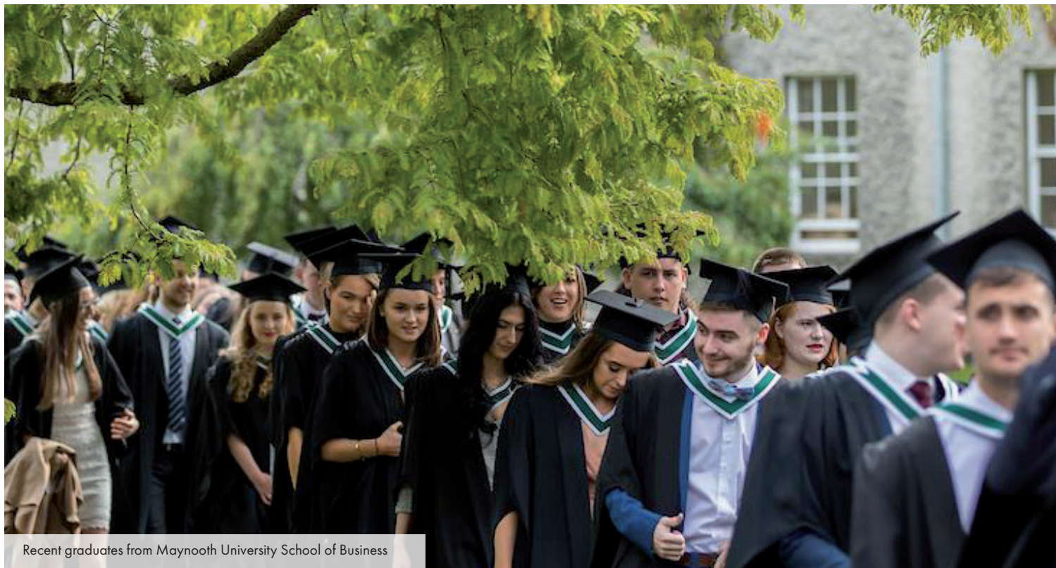
Recent graduates from Maynooth University School of Business

The Partnership is proud to support Maynooth University's Business Living Lab - specifically designed to help level the playing field for students from under-represented backgrounds.