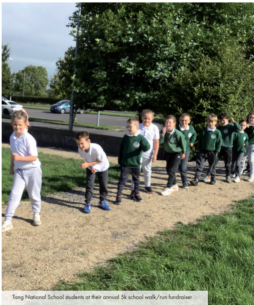
Tang National School students at their annual 5k school walk/run fundraiser