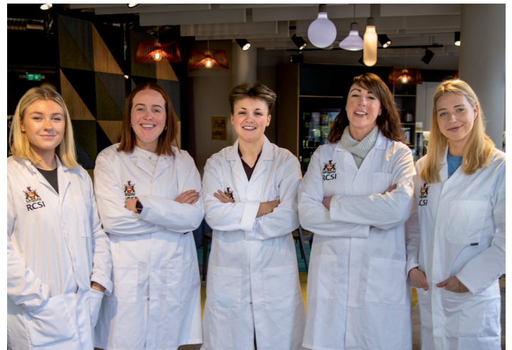
2022 Physician Associates students at RCSI University