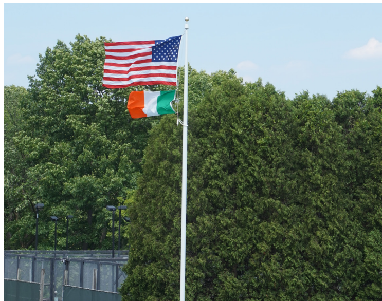
The Irish flag flying high above Schuyler Meadows for the Partnership's annual tournament