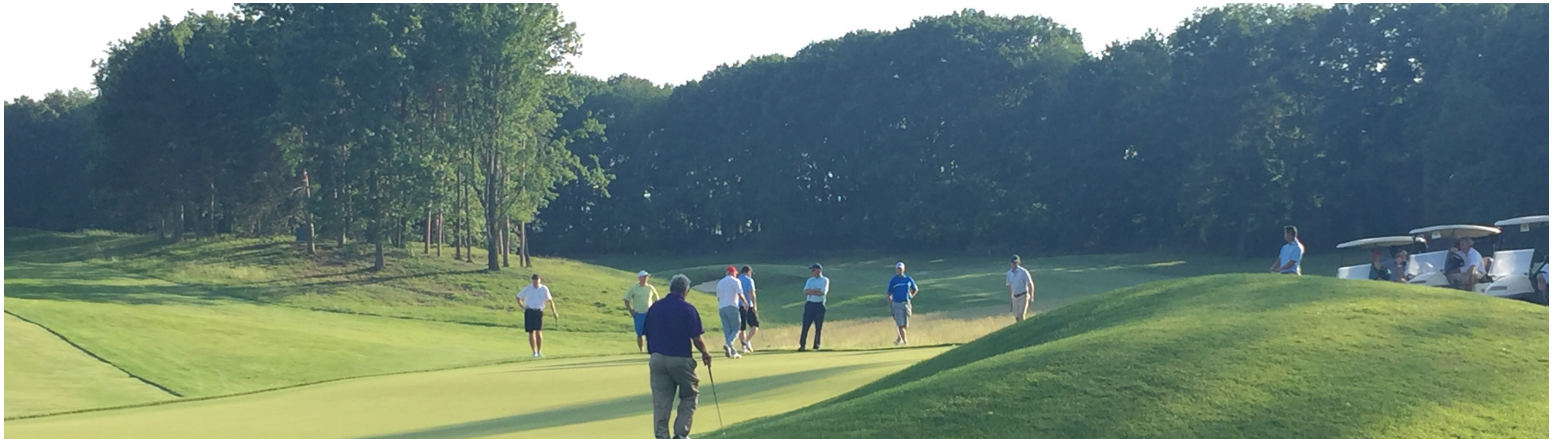
A nail-biting playoff served as an exciting end to the tournament.