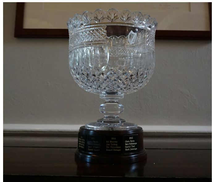
The Frank E. O'Brien III Trophy

Yes, there is. The Partnership can help arrange a visit with the school you would like to fund. Please note that the Partnership needs to receive your gift before scheduling a meeting with the school.