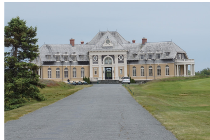
June 13, 2015 (to be confirmed) Newport Country Club Newport, RI