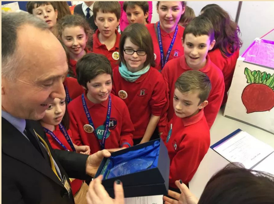
Ballyvaughan NS students receive an award for their RDS project on hydroponics

Thank you to all those who participated in the Irish Invitational. Your support will provide 2,000 additional students with the opportunity to engage in scientific learning and discovery at the Limerick Primary Science Fair.