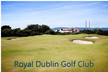
Royal Dublin Golf Club

Thank you for participating in the inaugural Irish Invitational!