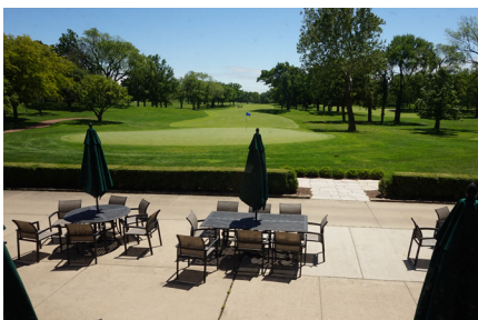
June 6, 2015 Beverly Country Club Chicago, IL