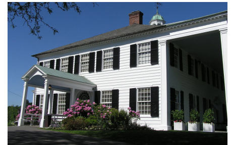
June 20, 2015 Schuyler Meadows Club Loudonville, NY