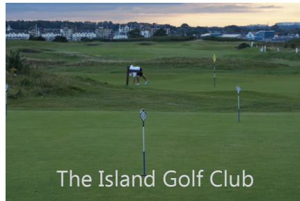
The Island Golf Club