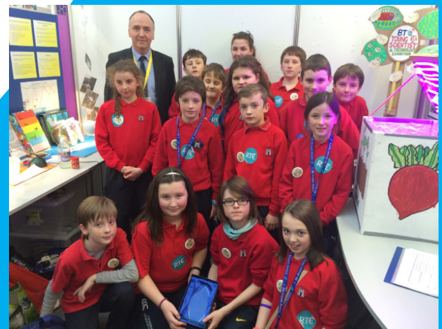
Students from Ballyvaughan National School, Co. Clare display their trophy at the RDS Primary Science Fair