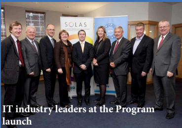
IT industry leaders at the Program launch

September 14-17: Irish Invitational Golf Tournament, Dublin, Ireland