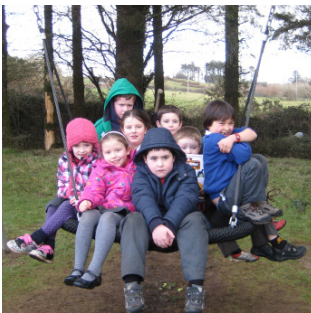
Derryclough students enjoy their new swing

Additionally, Derryclough was one of 31 schools that received a Partnership travel grant for the RDS Primary Science Fair, allowing 8 students to take one parent each all the way to Dublin for the Fair, where they presented their project on "how do wind turbines turn wind into electricity?"