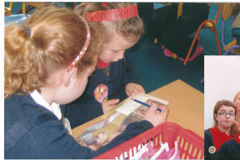
Above: "Biggies" help "smallies" learn to read

Here at the Partnership, we cannot wait to see what the future has in store for the incredible students and teachers at Derryclough!